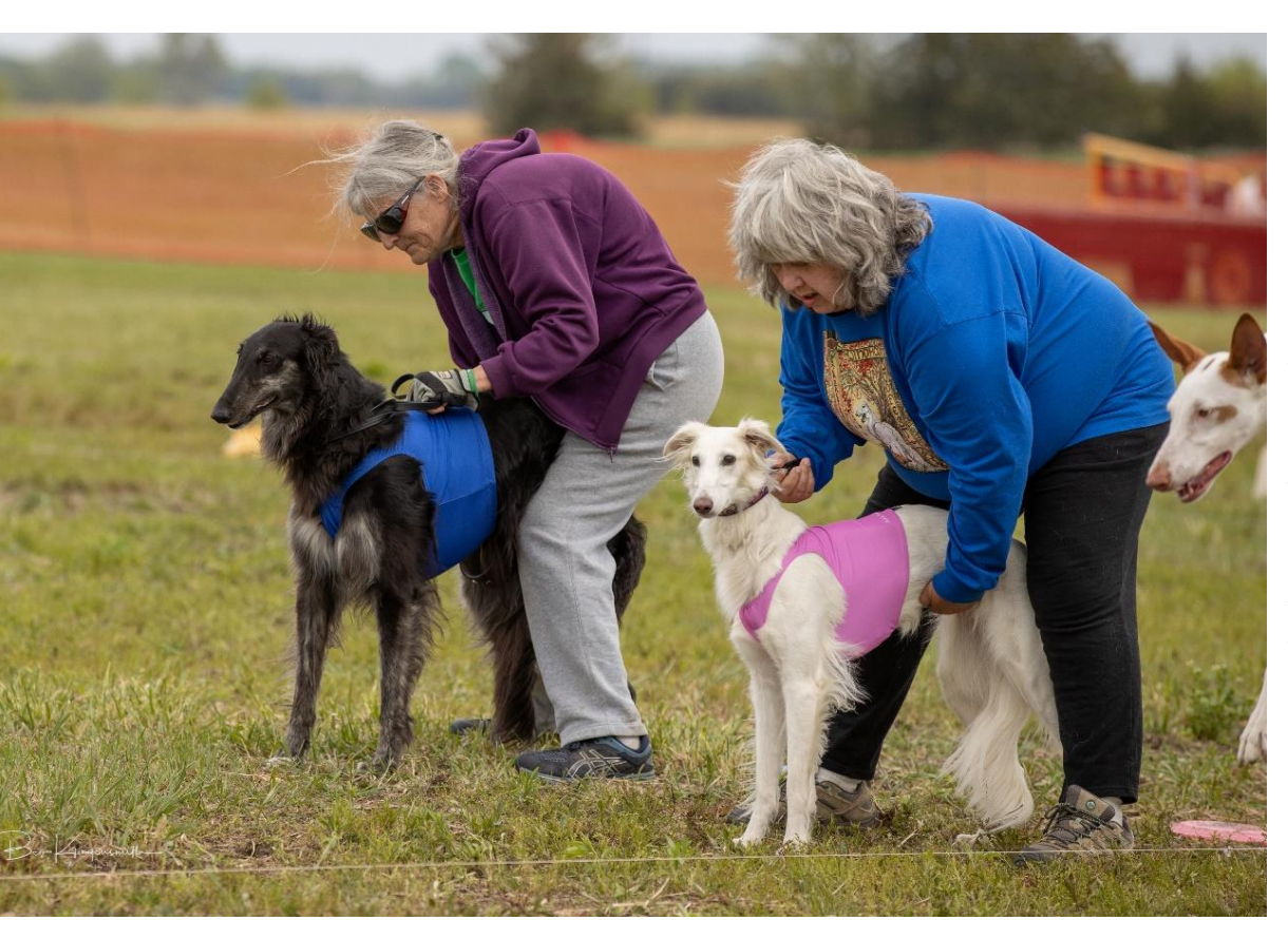
Borzoi Zip, Silken Windhound Chyna & Ibizan Hound Jadis at the line for BII run.