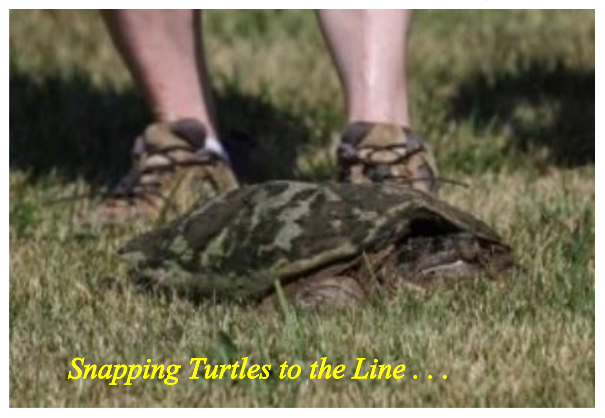
This 35-pound snapping turtle was discovered heading to the line during a Basenji run in Caledonia, Wisconsin. The alert huntmaster stopped the course in time to save the Basenjis from an encounter with this snapper. It's a reminder that we all need to be aware of what is going on during the course, and to look out for the little things that can cause problems. – from Greg Breitbach