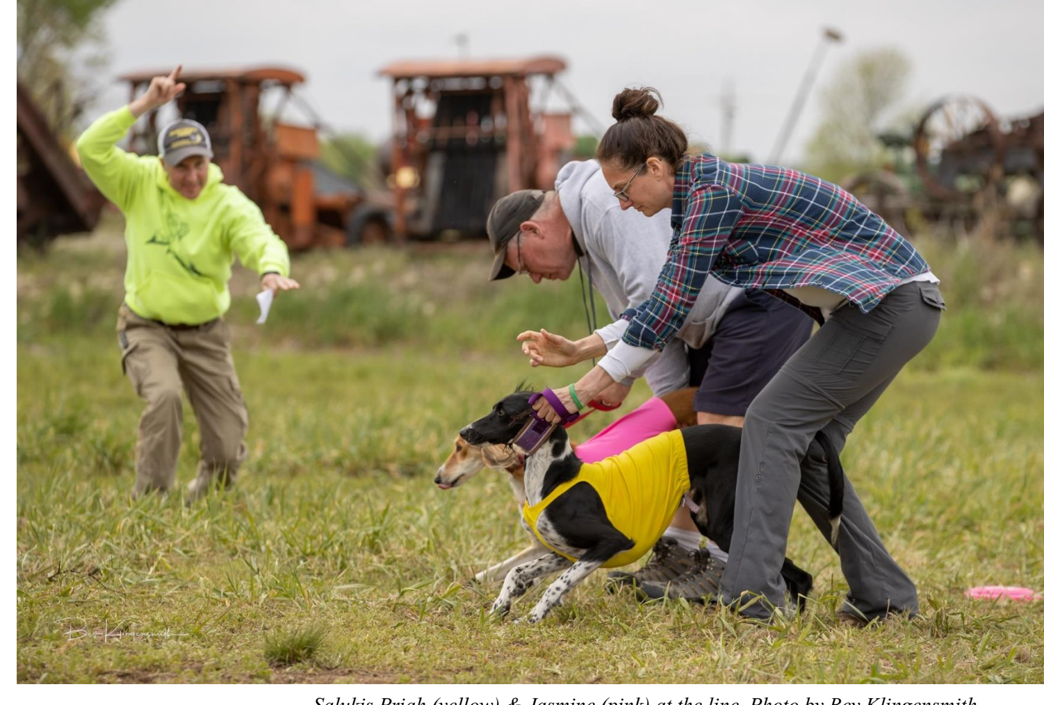
Salukis Priah (yellow) & Jasmine (pink) at the line.