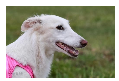
Silken Windhound Chyna